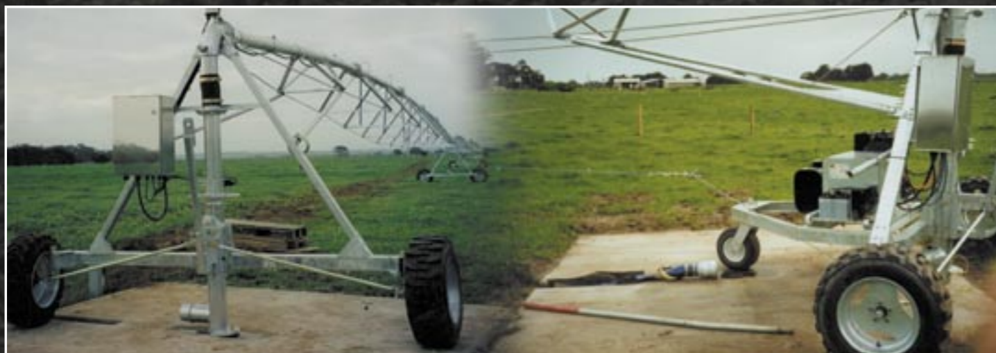
Mains power or genset options

The structural integrity of the ROTO-RAINER CENTRE PIVOT is enhanced by the use of corrosion resistant aluminium pipe, quality Australian hot dipped galvanising and construction by Australian engineers. Combined with the selection of quality components the owner of a ROTO-RAINER CENTRE PIVOT is assured of efficient long term service.