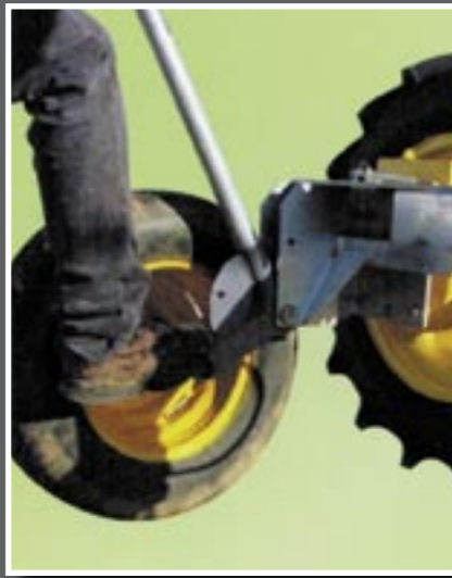
Raise tow assembly