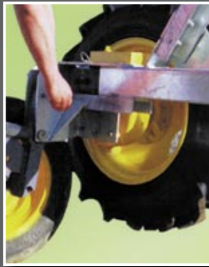
Insert lock pin